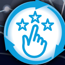
Equipment, Software & Service Support