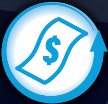
Reduces Your Energy Costs

With modular, plug & play switchgear, cleaner backup power solutions, & advanced dispatch software that reduces costs & lowers carbon emissions.