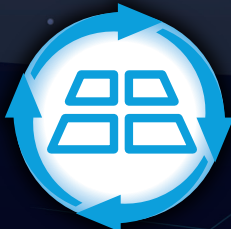
Scalable Solutions Operate In 12 Months