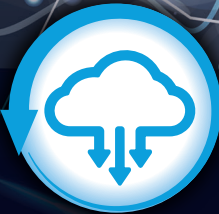
Lower Carbon Emissions