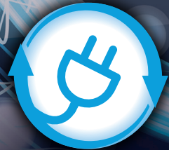
Advanced Technology For Dispatch With Solar & Storage